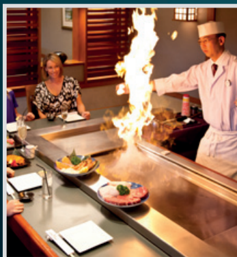
Hatsuhana Japanese Restaurant