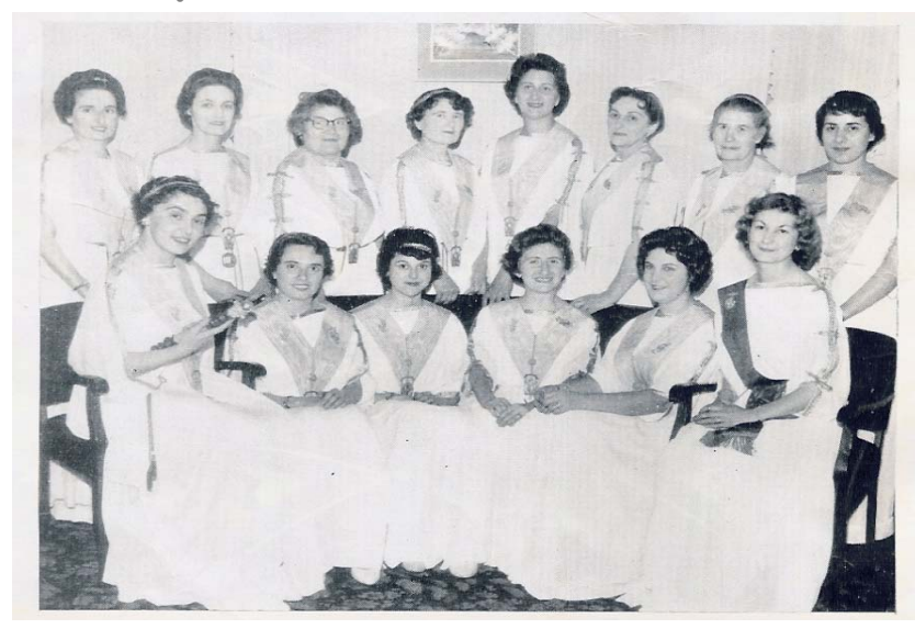
Athena Chapter No. 1 - year 1962 - Melbourne Do you know all the Sisters in this photograph?