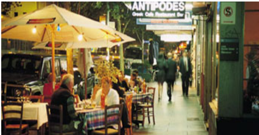
Lonsdale Street, ,the Greek part