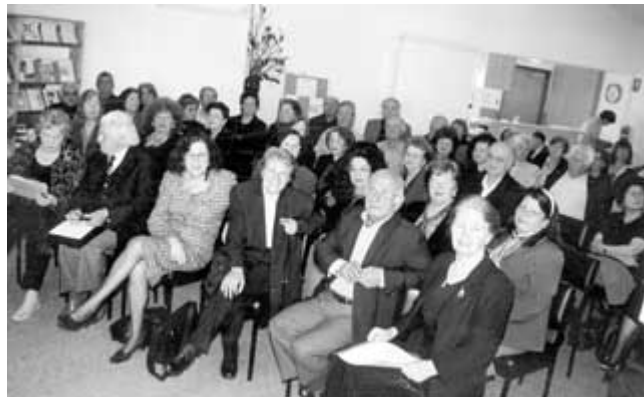
Guests and Ahepans at the function