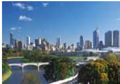
Melbourne's skyline, showing the yarra river with its skyscrapers in the background..