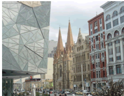
Melbourne's brand new Federation Square is in great contrast to the historic buildings in Flinders Street

Areas that were once docklands and factory sites are now being transformed into apartments and entertainment complex's that will see the Melbourne CBD area almost double once complete.