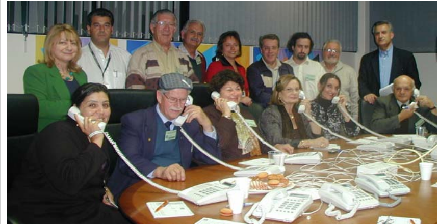
The team manning the phones in Sydney

A Radiothon was held in conjunction with SBS Greek Radio Programme on September 8 th , 9 th and 10 th .